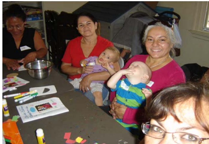
Caregivers in training at Silver Lake Park, with their hands full!

FFN program is being offered in both Spanish and English and it's Free . Child care will be offered for all classes and events by qualified early childhood teachers.